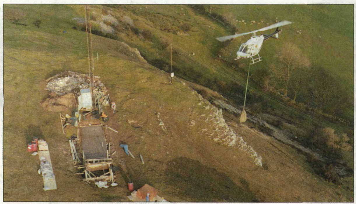
Bird's eye view of one of the helicopters making a delivery to the construction site at Moel Hiraddug.