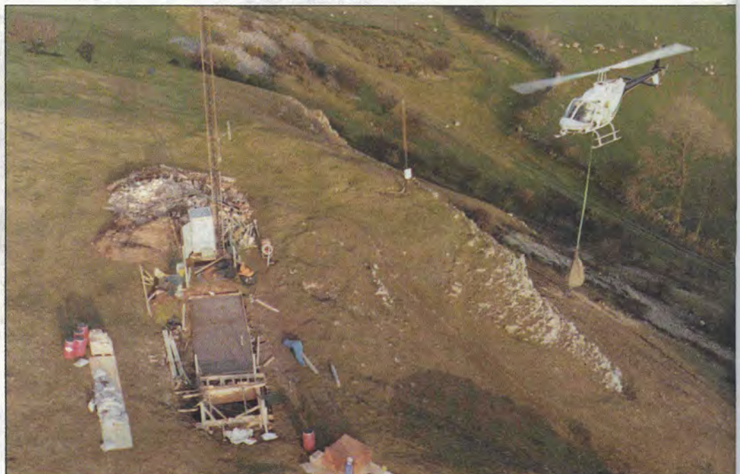
Bird's eye view of one of the helicopters making a delivery to the construction site at Moel Hiraddug.

local authority and other organisations and groups to ensure the environmental impact of the scheme was minimised.