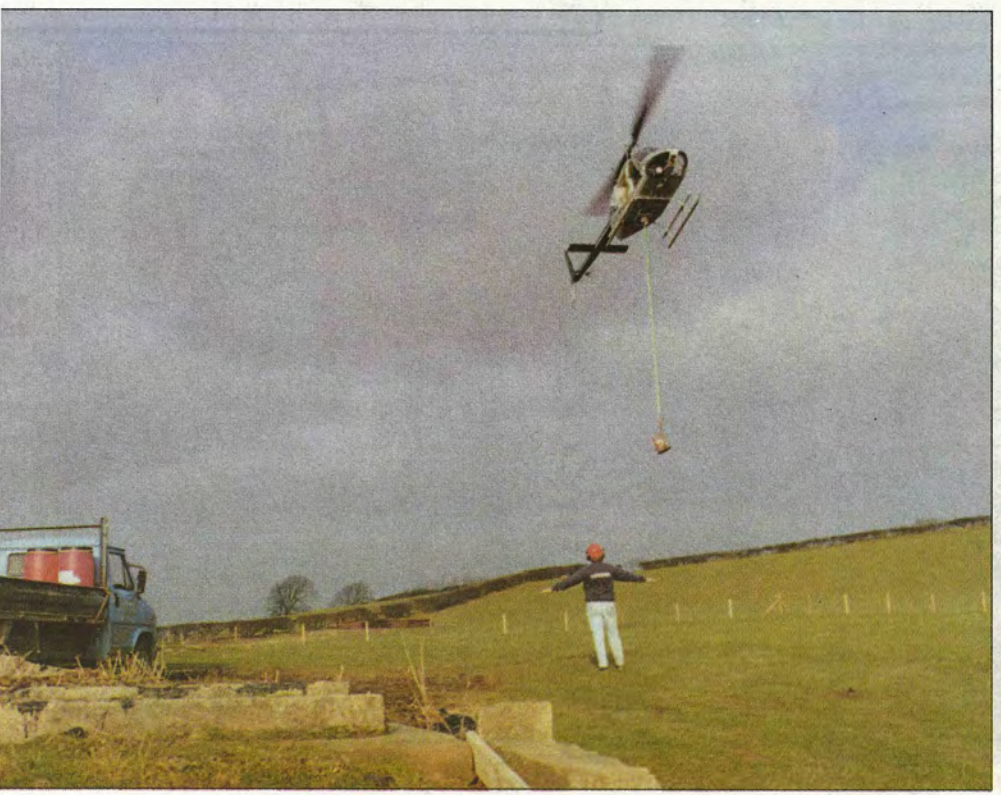
its weighty cargo whilst the other comes in to land.