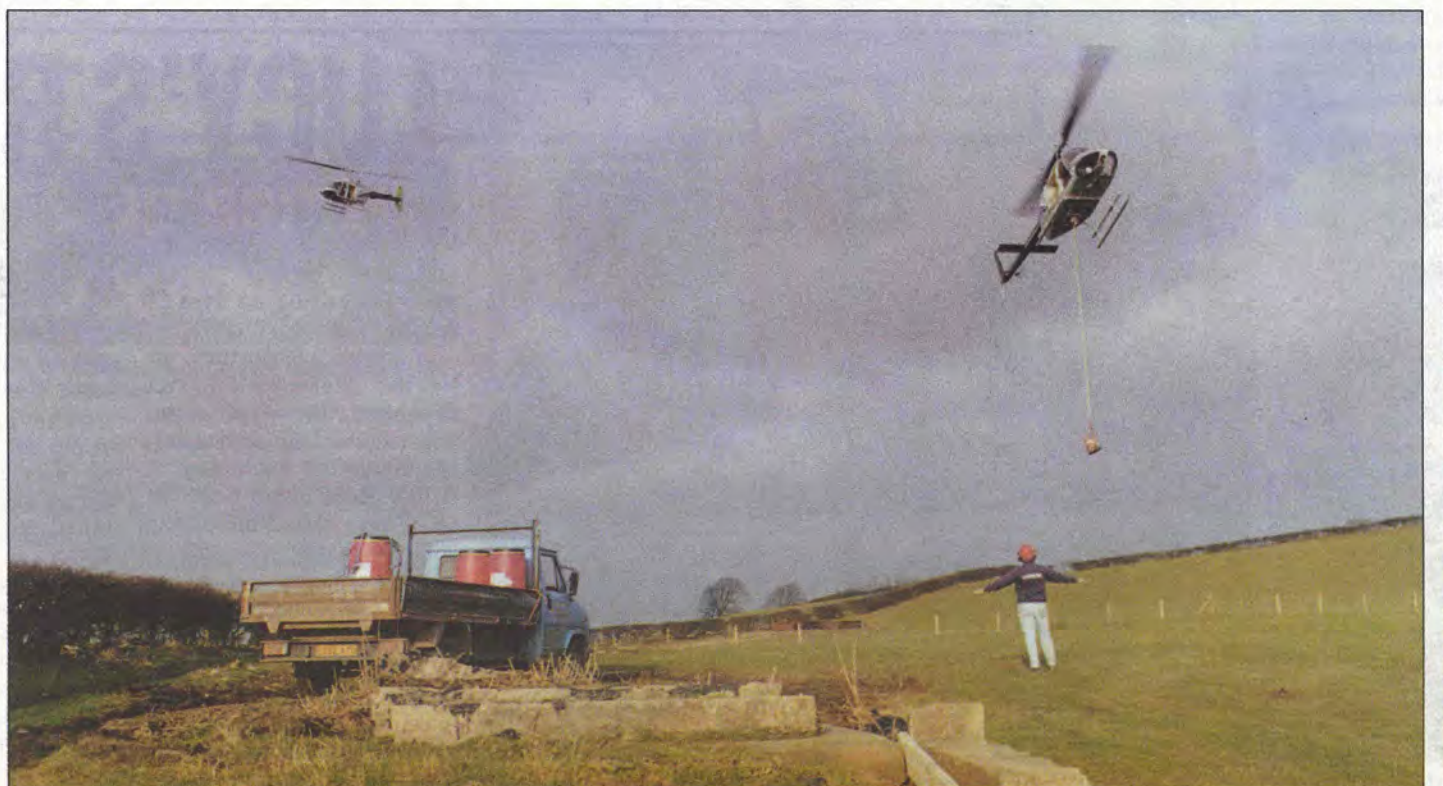
One of the helicopters takes off with its weighty cargo whilst the other comes in to land.