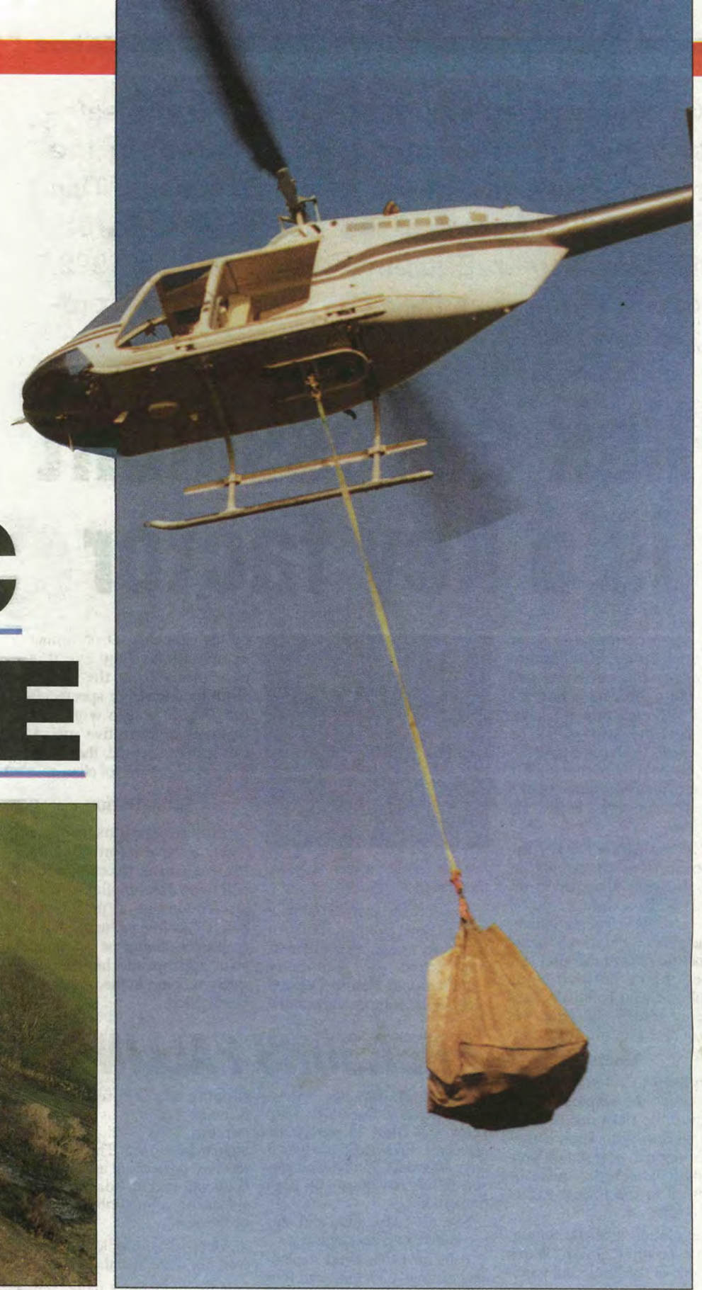
Bricks are ferried to the hilltop site in a canvas sling.