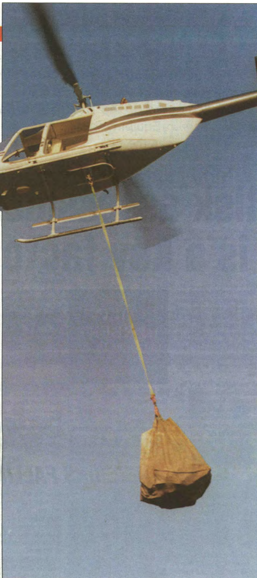
Bricks are ferried to the hilltop site in a canvas sling.